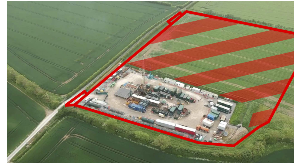
West Newton A wellsite near Burton Constable Hall. A major expansion is planned. More wellsites & wells also planned. Act now to have your say.